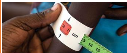
Mid Upper Arm Circumference (MUAC) Tape

Anthropometric measurements such as the mid upper arm circumference , weight, height, and age that reflect wasting, stunting, or underweight are quite effective in screening and selecting frail undernourished children at a high risk of death. However, these measurements do not inform the understanding of mechanisms that lead to death. Standard clinical and laboratory measurements on the other hand are critical in guiding hospital management of such children but often lack important biological explanations leading to death. Understanding such critical